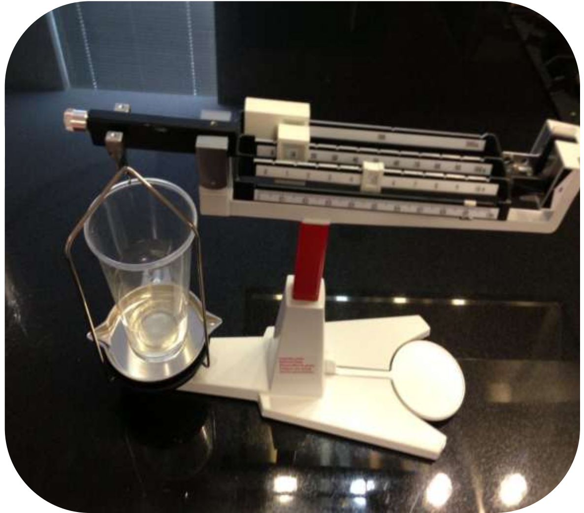
Weighing Unsaturated Fat